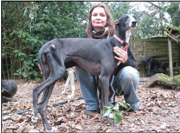
Airis from Arca de Noe, now happily homed in Holland

Failure to make a will means that your relatives will have to struggle to sort out the destination of your assets (and might incur huge lawyers' bills) AFTER HM Revenue and Customs have taken a large slice of your estate. Tax efficiency will not be a factor, as no tax-free legacies to charities will be made. So, by making a will, your possessions go where you intend, you achieve peace of mind and have the opportunity to reduce inheritance tax by making legacies to charities.